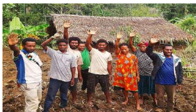
New converts working to build the Waro bush-materials church.

The small group, worked together to build a simple church on the donated land. Most of the church members walk long distances to worship in Waro, and continue to pray they can bring more Waro locals to Jesus and the truth of His Word.