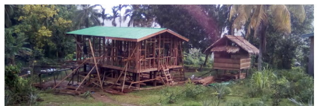
The priest’s new home under construction.