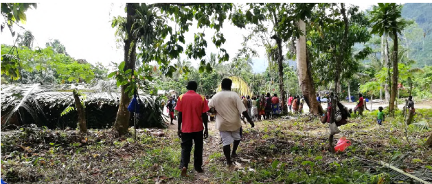
VIA workers arriving at a bush village for an outreach program.

Local members are now using the underneath area of an incomplete member's home for Sabbath worships and other meetings.