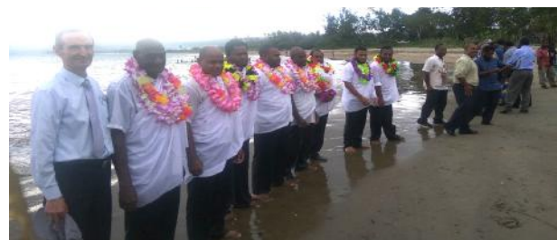
Witnessing the prison inmates' baptism at Black Sand Beach in Port Vila, Vanuatu.

It is good to know that the Union and local Mission leaders appreciate the fact that remote churches are being planted and cared for and thousands of new members are joining our church because of the faithful ministry of our VIAs. Most church leaders realise that without the support of VIA, the rapid growth in our island fields would be significantly reduced and they wish to thank all who support VIA. Thank you!