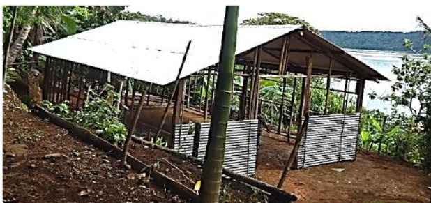
Yombo Island Church with a new roof.

"God is rewarding the efforts of everyone involved. It's an obvious token of God's blessings and presence among His children who are committing their effort, resources and time for the salvation of others. So we'll work until Jesus comes." What a joy it is to hear these wonderful reports of God's leading through VIA.