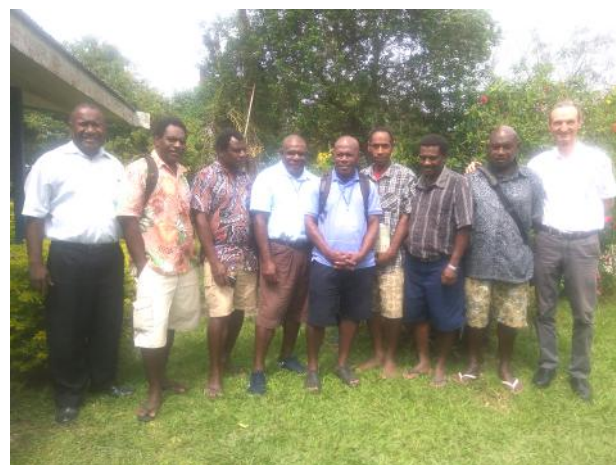
Visiting the VIA's in Vanuatu's Northern Islands.