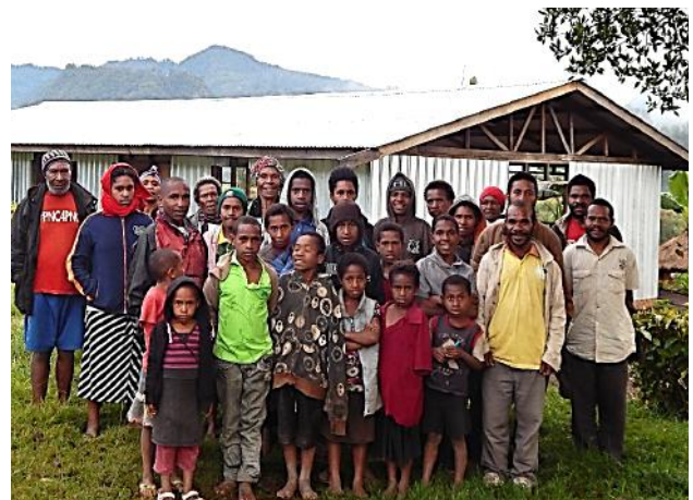
Some of Maland's members with their new church.