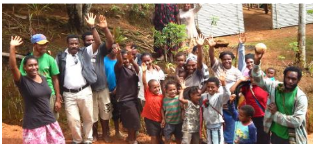
Hello! from some Yombo Island members.